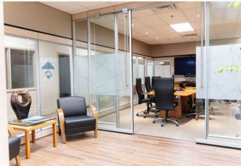
Conference room and vestibule