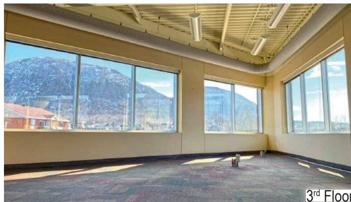
3 rd Floor