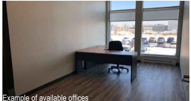
Example of available offices